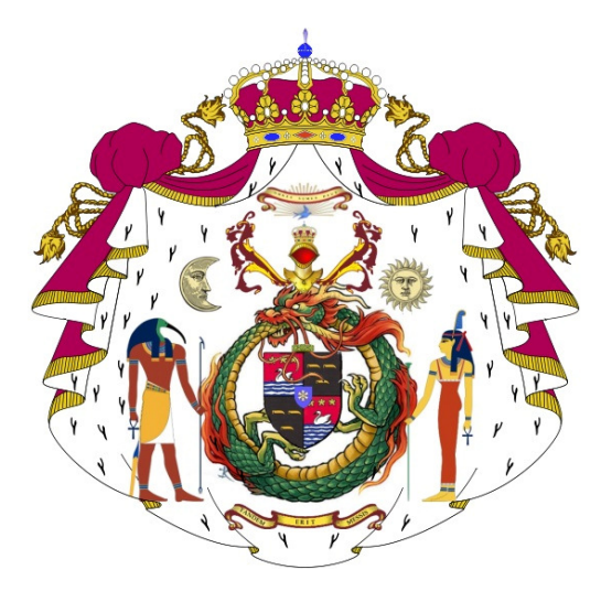
Noble House Molier Anno 1157 Tandem Erit Messis

Royaum Sans Frontières, 23 october 2013,